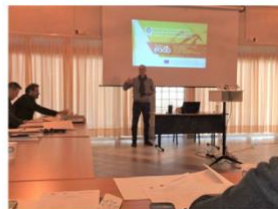
Nextfood presented at CIHEAM Chania, Greece!