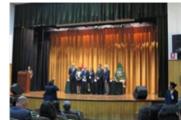
Presentation of NEXTFood project in the "International Conference on Innovative Education in Agrarian Topics"