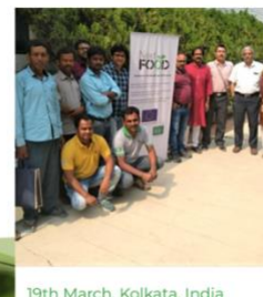
19th March, Kolkata, India