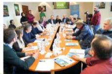
The Agronutritional Cooperation RCM, the American Farm School and the Institute for Employment