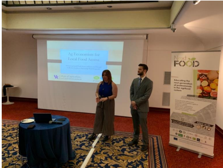
Students from the ISEKI case participated at the meeting and presented their projects