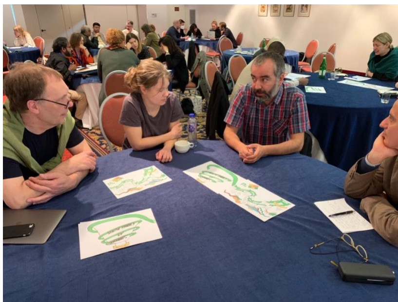
Participants at the workshop on the NextFood roadmap