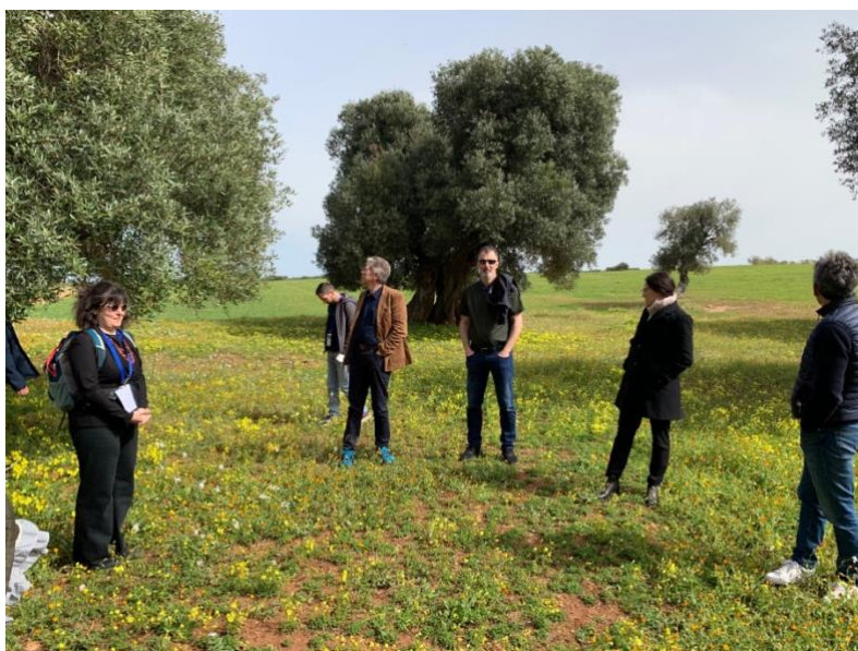
Visit to the coastal park (part of the CIHEAM case study) in Bari